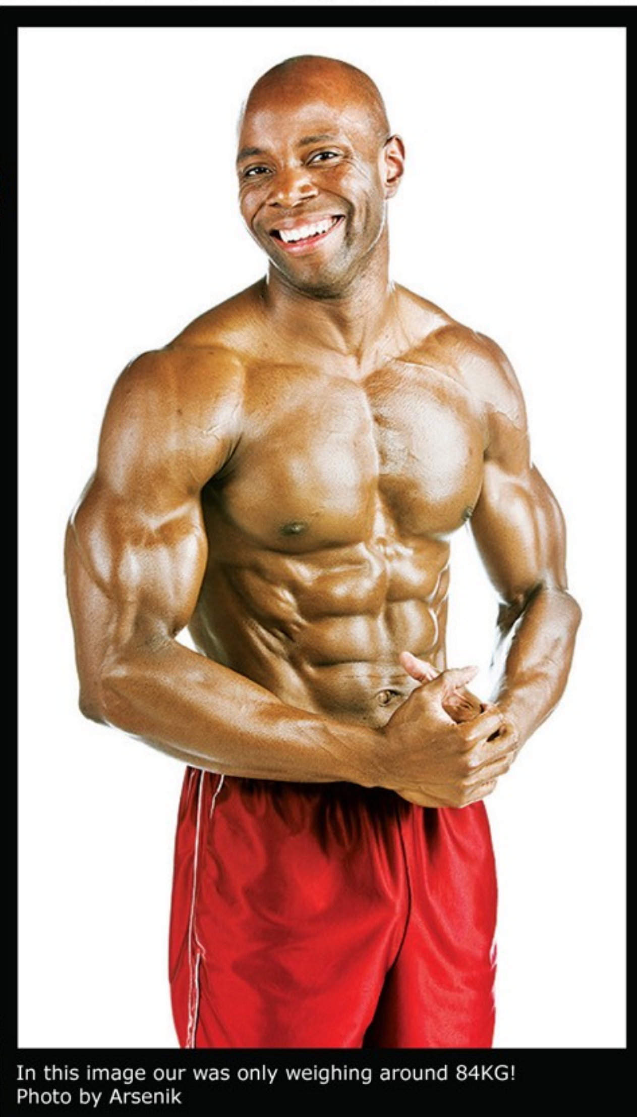
In this image our was only weighing around 84KG!